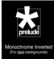
Monochrome Inverted (For dark backgrounds)